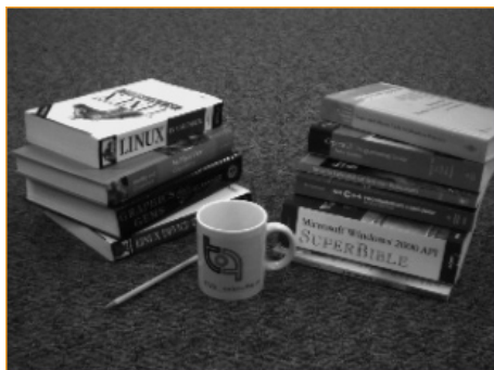
Rectified intensity image